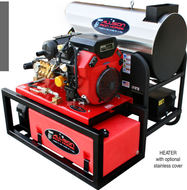
HEATER with optional stainless cover